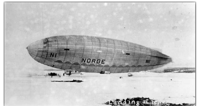
Airship Norge landing in Teller, Alaska, 1926

The Norge departed Ny-Ålesund on May 11th at 9:55 am. 16 men were on board, and one dog--Nobile took along his little fox terrier, Titina. The expedition succeeded in crossing the North Pole at 1:25 am Greenwich time on May 12th. The Norwegian, American, and Italian flags were dropped on to the ice below, and the flight continued on towards Alaska. Over Alaska, strong storm winds forced them to land, even though they weren’t exactly sure where they were. They ended up landing near Teller, northwest of Nome, on May 14th. The expedition was a success and the men (and dog) returned to their own countries as heroes.