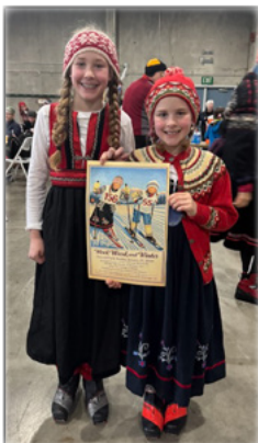
Linda Bustamante Photo