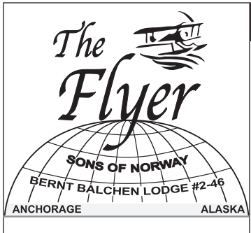
VIKING HALL 349-1613 www.sofnalaska.com