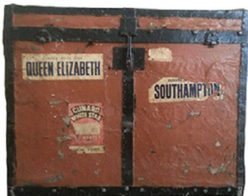
Birkedal family travel chest marked with stickers for Queen Elizabeth , the Cunard Line, and Southampton.

In the March issue of the Flyer I began the story of my family’s immigration to the United States from Norway. In Part I of that story I took you up to the day we boarded the passenger ship that would take us from Stavanger, Norway to England, the first stage of our journey.