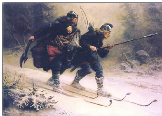
Skiing Birchlegs Crossing the Mountains with the Royal Child, by Knud Bergslien.

Yes, you are in for another Norwegian history lesson. I can't stop myself. I am so excited; the Norwegian film industry has made a film about the Birkebeinerne (the Birchlegs). In fact, the movie is called "Birkebeinerne". The director is Nils Gaup, one of Norway's greatest directors, who won an Academy Award for his movie about a legendary Sami skier in the 1987 movie "Pathfinder".