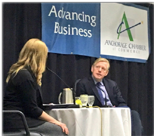
Falling Oil Prices: Recommendations for Alaska and other Arctic Countries.