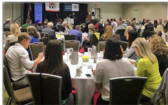
Luncheon and presentation sponsored by the Chamber of Commerce and the Alaska World Affairs Council.