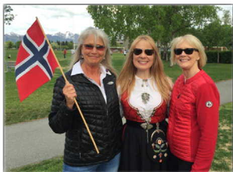
Greetings from the Syttende Mai Parade!