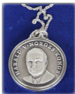
King Harald Medallion will be available for bidding.

Every other year delegates from our lodge attend the Sons of Norway district and international conventions. Each delegate pays their own travel, lodging and registration expenses. In an effort to assist with a portion of these costs, the proceeds from the Silent Auction will be set aside in a special convention delegate fund.