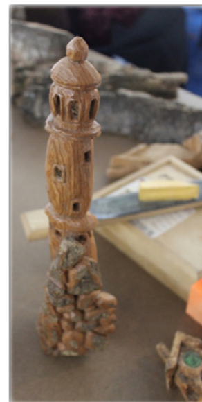
Amazing creations can be found at the seminar.