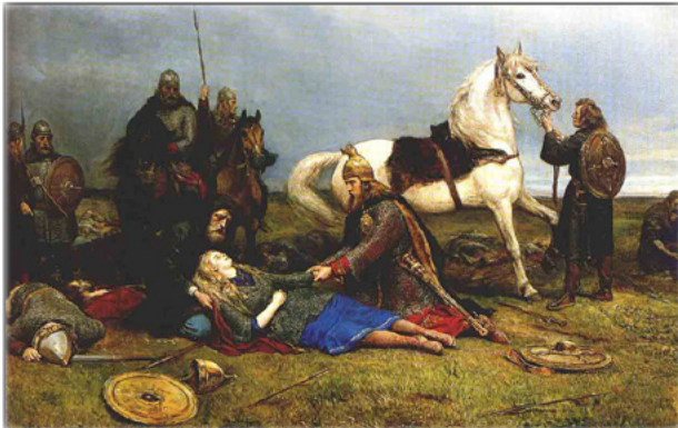
Hervor, daughter of Heidrek, dying at the Battle of the Goths and Huns, a painting by Peter Nicolai Arbo.

President's Message continues from Page 1