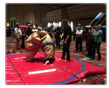
Sumo Wrestling in the Balloon Room!