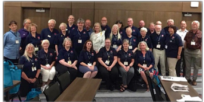
District 2 delegates

The delegates also voted on the location of the 2020 International Convention, which will be held in Hamar, Norway. The last time the convention was held in Norway was in 2000.