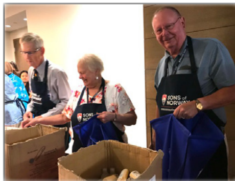
Mickey helping pack hygiene kits for charity