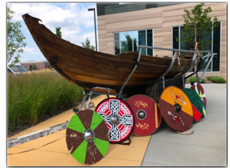
Hotel parking at a Norwegian convention