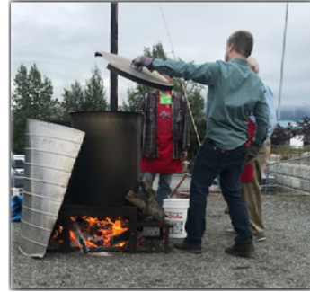
Top three photos submitted by Ruth Kvernplassen.