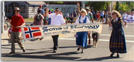
It was a hot day for some 'cool' Norwegians!