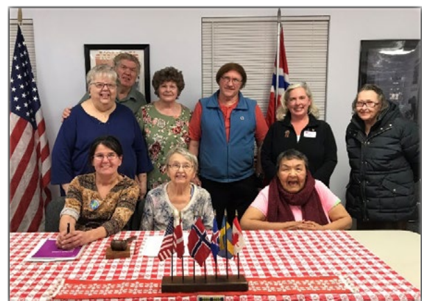
Meeting at Island Viking Lodge in Kodiak, AK (October 2019).