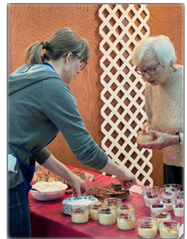
Photos of this WONDERFUL event